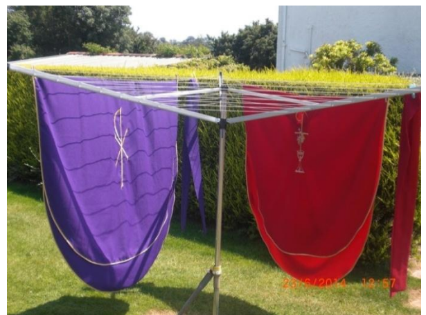
A rare sight in Ipplepen! The "chasubles"!