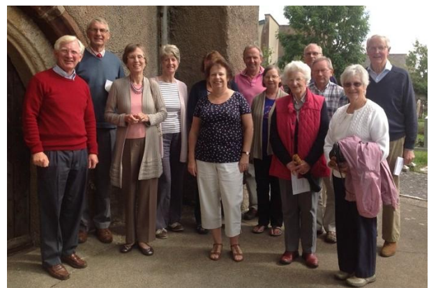
Sidesmen/women had a "teach in" on how best to carry out their duties