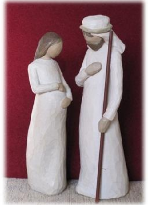
The Ipplepen Posada figures